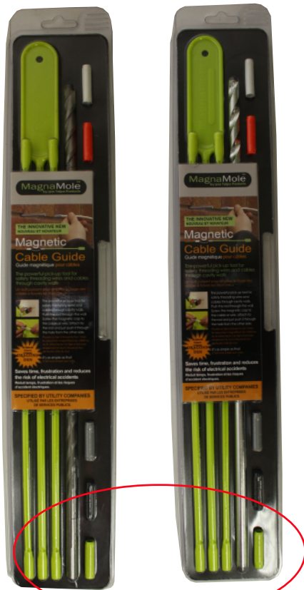
Part #'s SJM2200/SDS SJM2200/MAS

*Available with either an SDS bit or Masonry bit